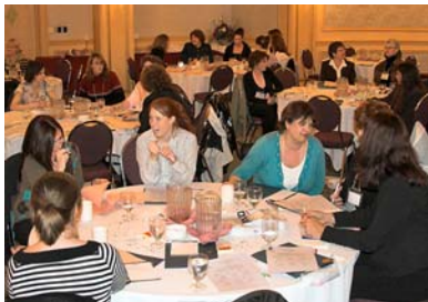
Admin Workshop held at the Charlottetown Hotel

Later in the afternoon we broke off into three groups and had guest speakers for Career Advancement, Looking Professional, and Cancer Awareness. Each session was well attended and everyone left feeling refreshed and rejuvenated. We are already looking forward to next year.