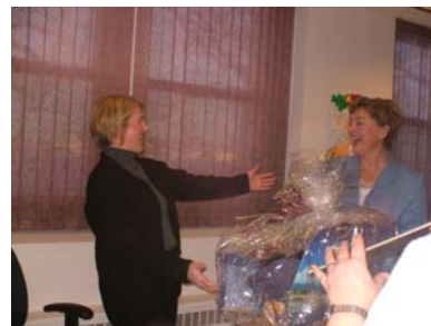
Surprise - Christmas Comes Early